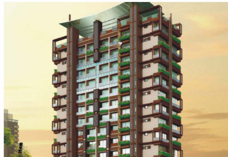
Rite Galaxy - Rite Developers Andheri, Mumbai.