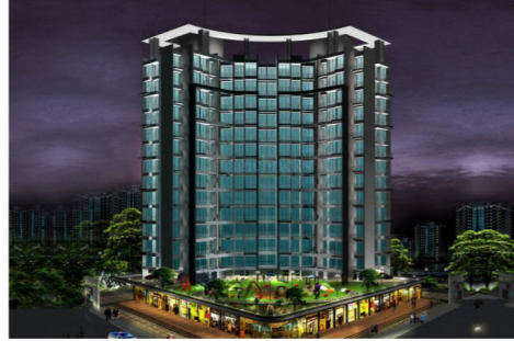
Platinum Avior - Platinum Group Roadpali, Navi Mumbai.