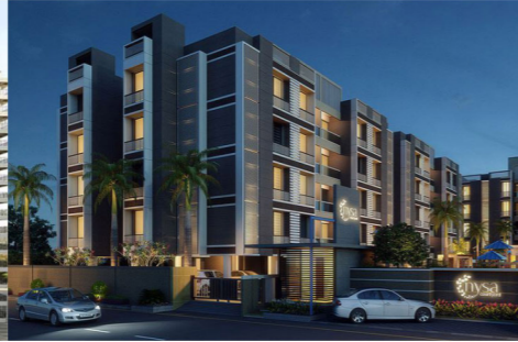
Nysa Courtyard - Challenge Infrastructure Vadodara.