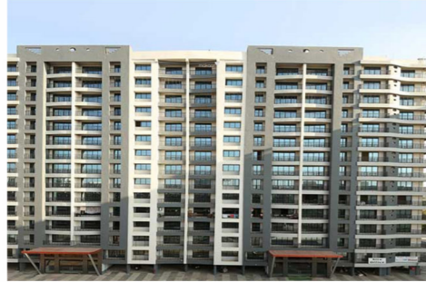
Bhairav Residency - Leena Builders Mira Road, Mumbai.