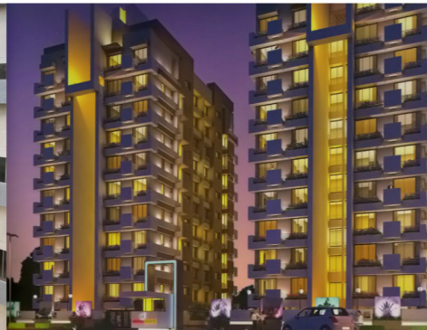
Crystal Heights Palanpur, Surat.