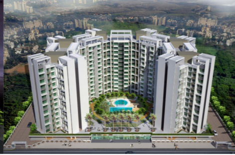
Bhoomi Gardenia - GDC Buildcon Kalamboli, Navi Mumbai.