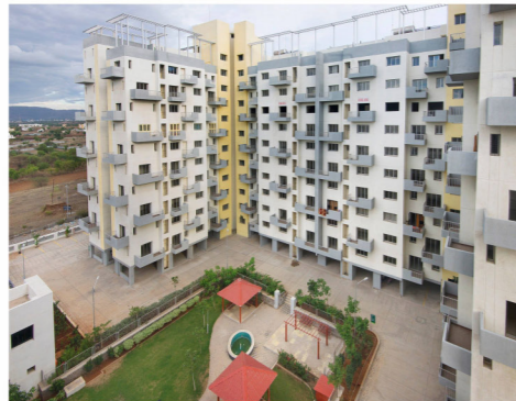
Inora Park, Undri - Tata Housing Handewadi, Pune.